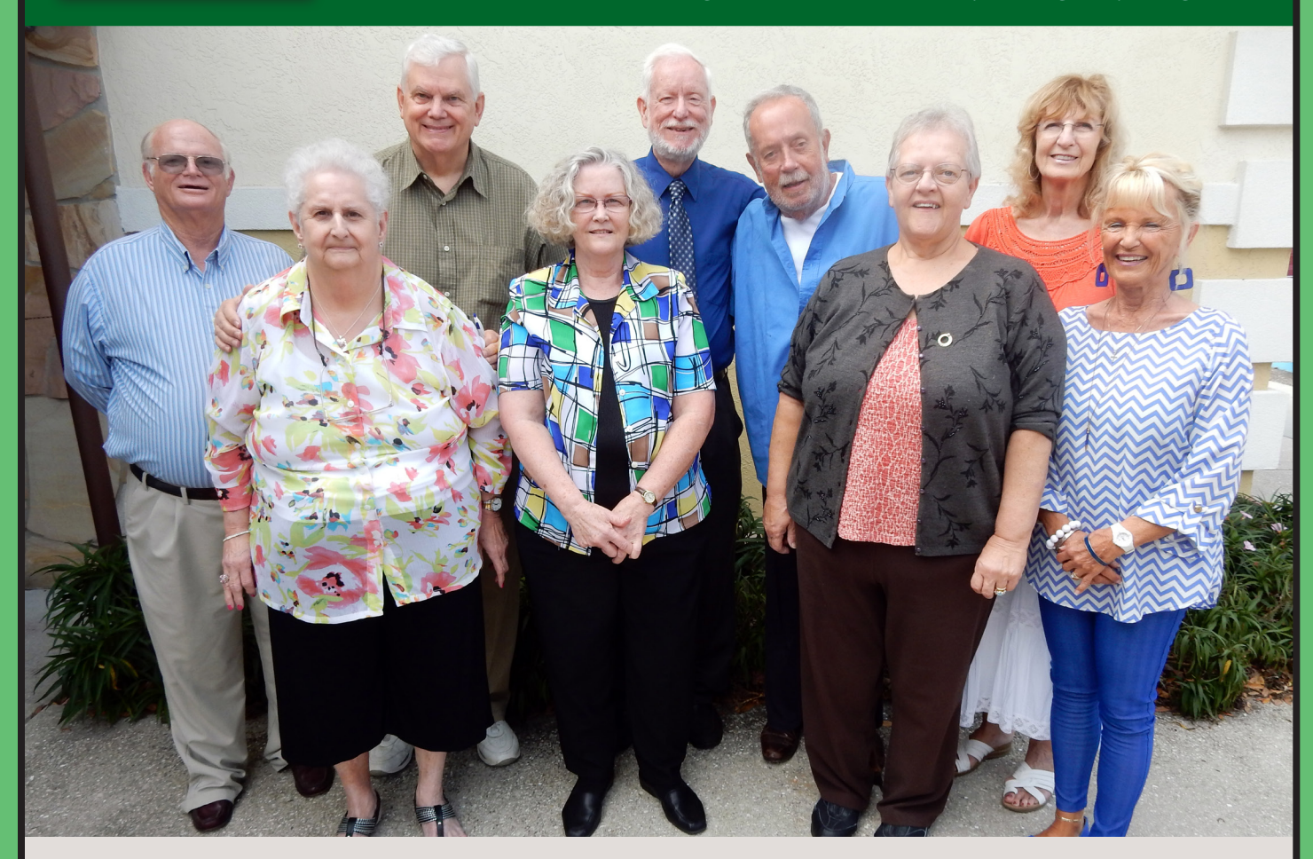
The Many Faces of FIT

This month we will focus on what the Bradenton "Character Development" group has been able to do through teamwork. A year-and-a-half ago classes which meet at FIT headquarters were so small that there was one week in which noone showed up! Through persistence and working with the local Children and Families agency, classes have grown and we recently had 28 in attendance, including facilitators and clients. The group typically facilitates two to three different FIT courses simultaneously on Thursday nights from 7-9 PM. When groups get too large, classes are conducted in two separate buildings.